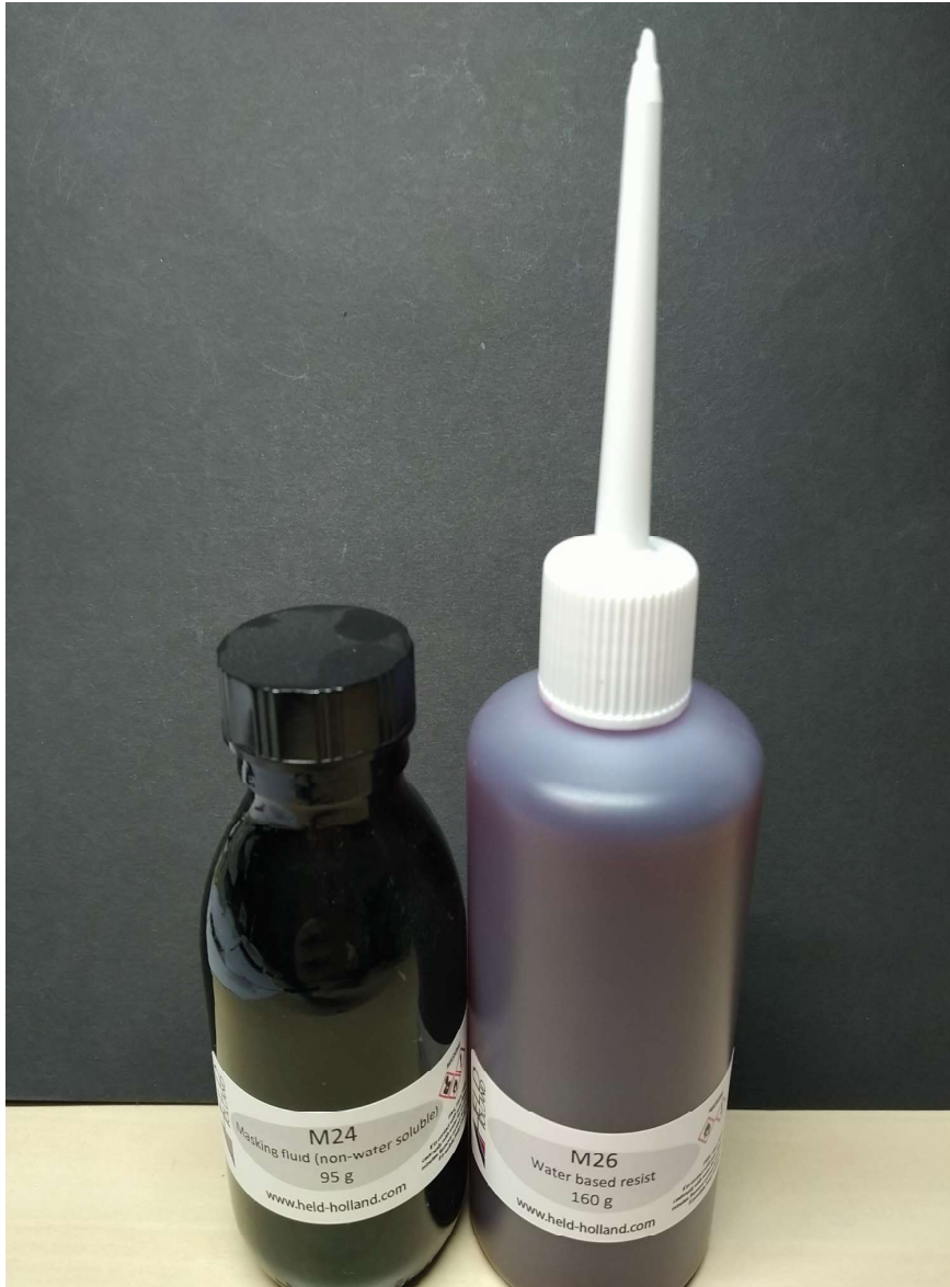
M24 and M26 (63-024-000 and 63-026-000)

Spirit based masking fluid and Water based resist